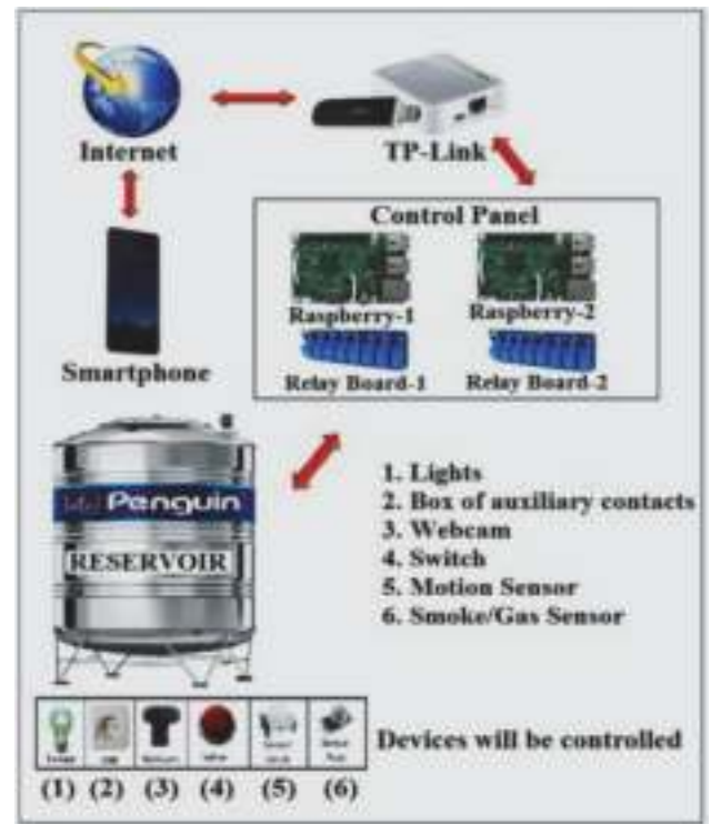
Figure 3 Illustration of reservoir control by using Internet Network