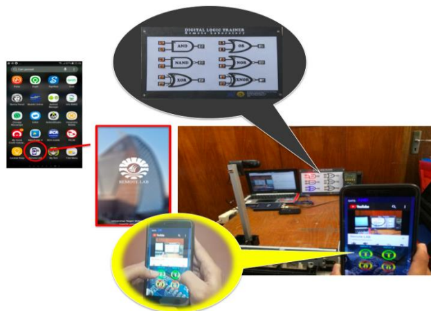
Fig. 3. Remote Lab as a Tool to Overcome the limitations of Practicum facilities without present in Real Lab (Designation of Value in Real-time with Real devices)

The Remote Lab model of Digital Electronics is one form of interactive multimedia that can support conventional practice in real laboratories. After seeing the conditions and needs regarding the need for a learning strategy that is Distance Learning through Remote Lab, the next step is to search for models and designs that will be developed. Determination of the model is intended to choose the right model and look for references to the model to be developed. While the design determination concerns the software that will be used in developing Remote Lab-based learning in this case using Smartphone Android, the Arduino UNO Microcontroller, IoT, Android Applications, and Interface Arrangements. In doing the practicum by using the Remote lab. The device needs to be installed first. Furthermore, this virtual remote can be used online. to do a practicum measuring electric current and voltage, students still use the module as a guide in carrying out the practicum. Furthermore, measuring current and voltage, and waveforms with real devices are multimeters and oscilloscopes (picoSCOPE), and it is possible to use other real equipment (Fig.3).