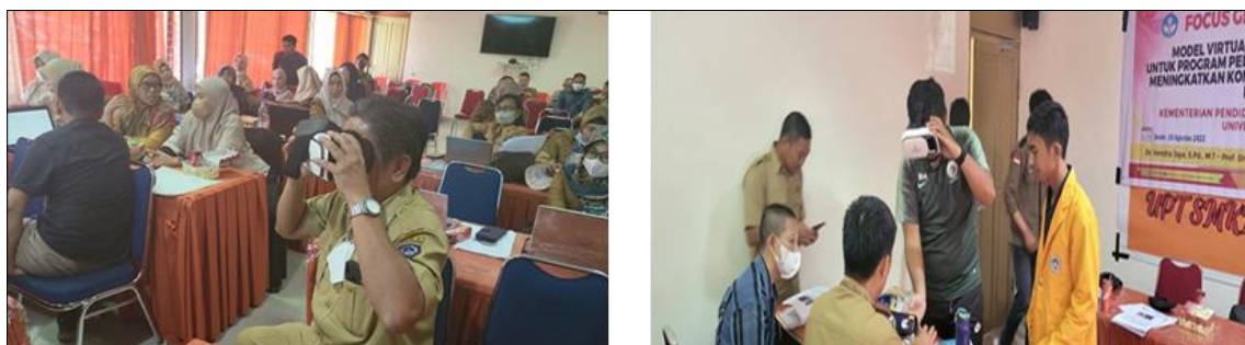
Figure 3 Teachers Implement Virtual Reality

Virtual reality implementation has generally been carried out systematically according to the model or procedure, starting from design, development/production, utilization, management, and evaluation. In particular, the virtual reality implementation model applied by SMK teachers in Makassar City can be described as follows.