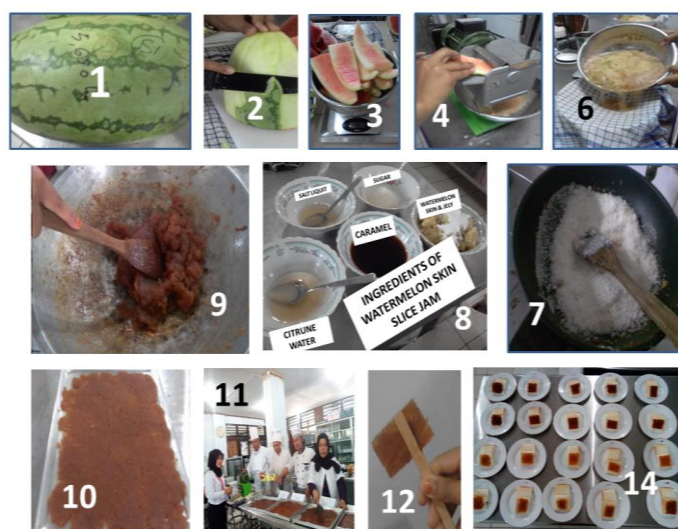
Fig 1. The slice jam process

The process of making watermelon skin slice jams begins with the process to prepare the ingredients and equipment, the ingredients is cleaned (watermelon) by washing with clean water to obtain a clean watermelon free from dust and dirt on the watermelon. the next process is to skin the watermelon skin to reveal the inside skin that is more white, and afterward, to separate the colored part of the watermelon (the part that tastes sweet on the watermelon and the most frequently consumed). afterward, the white watermelon skin is grated by using the coconut grater. the grated method aims to obtain the soft watermelon skin and still has the coarse/fibrous texture of the watermelon skin, as well as to improve/maintain the characteristic of watermelon. the next process is to squeeze the watermelon skin. this process aims to reduce the water content in the watermelon skin to accelerate the jam making process. afterward, the process to weigh each ingredient based on the determined formula. the process of making watermelon skin slice jams as figure 1.