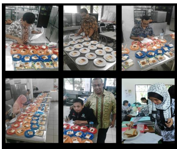
Fig 3. The picture was proses organoleptic test.