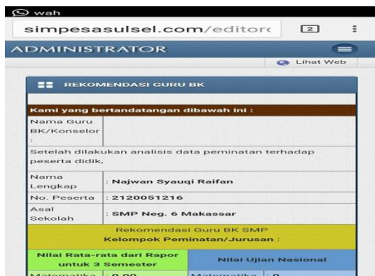
Picture 5. The result of SIMPESA application

Design of this application uses android operation system which allows users to both teachers and students to access the service anytime and anywhere by using a mobile phone, computer. SIMPESA result consists of profiles of students, interest in the field of study, grades, test scores, parental expectations, non-academic achievements and recommendations from teachers BK. For more details about SIMPESA application can be downloaded on the play-store by typing SIMPESA or can be viewed on the website http://simpesasulsel.com/