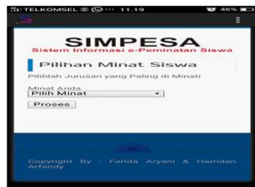
Picture 4. The Choices of Student's interest on SIMPESA