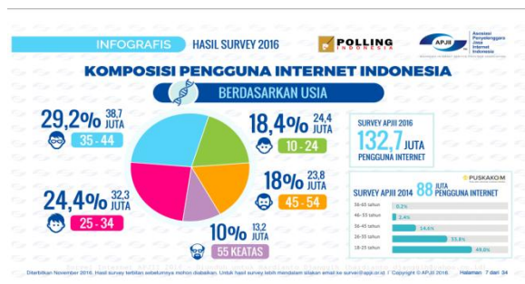
Secondary Data: Adapted from Survey Results Indonesian Internet Service Provider Association (APJII) November 2016

This is in line with the survey results Indonesian Internet Service Provider Association (APJII) Survey results released in November 2016, with a survey in April 2016, a total of 132.7 million people, the survey of Internet users in Indonesia by Age, describe: