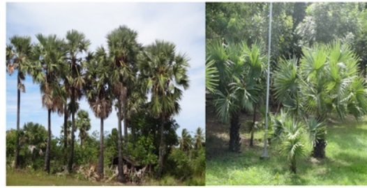
Figure 2. The native lontar palm tree ( Borassus flabellifer Linn) in Jeneponto South Sulawesi, Indonesia

In Indonesia, the palmyra palm is also known as the lontar palm or siwalan tree. The palmyra plant ( Borassus flabellifer Linn; Figure 2 A) belongs to the Arecaceae family. Other names of palmyra plants are listed on Table 1.