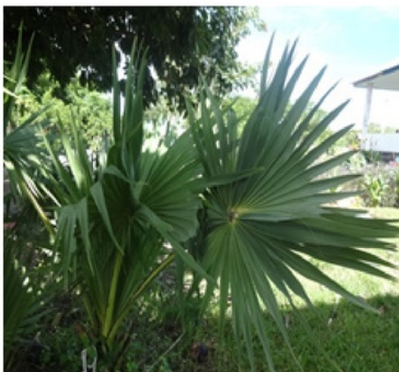
Figure 4. The leaves of a young South Sulawesi lontar palm

The leaves of the lontar palm tree (Figure 4) have a very important role for the overall growth and development of other organs, stem, empelur, flowers and fruit. The lontar palm has odd pinnate leaves appear at the rod tip and whorls that comprise 25 to 40 pieces in the shape of a fan. Each leaf stalk grows up within a month. Green leaf blades, rather gray, have a width of 1 to 1.5 m and form into 60 to 80 segments. Each leaflet bone is supported by leaves 40 to 80 cm in length under strands of leaflets, and have a forked branch. The long petiole is usually woody brown or black, and is thorny along its back.