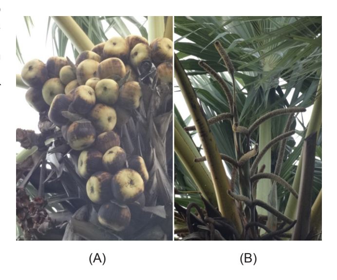
Figure 5. Fruits (A) and flowers (B) of South Sulawesi lontar palm

Study by Hammado (2008) reported that each ovary has three boxes of ovules, depending on the process of fertilization/pollination. The number of seeds in one palm fruit can range from one to three. Each palm tree produces 6 to 12 bunches of fruit at a time, or between 200 to 300 pieces of fruit each year. Palm fruit are round in shape with a diameter of 10 to 15 cm. The young fruit are green and becoming dark purple to black on maturing (Figure 5B). The flesh (endosperm) of the fruit is edible; it is sweet, has a gelatinous texture and is watery, and hardens after darkening. One palm fruit contains three seeds and the shell is thick and hard.