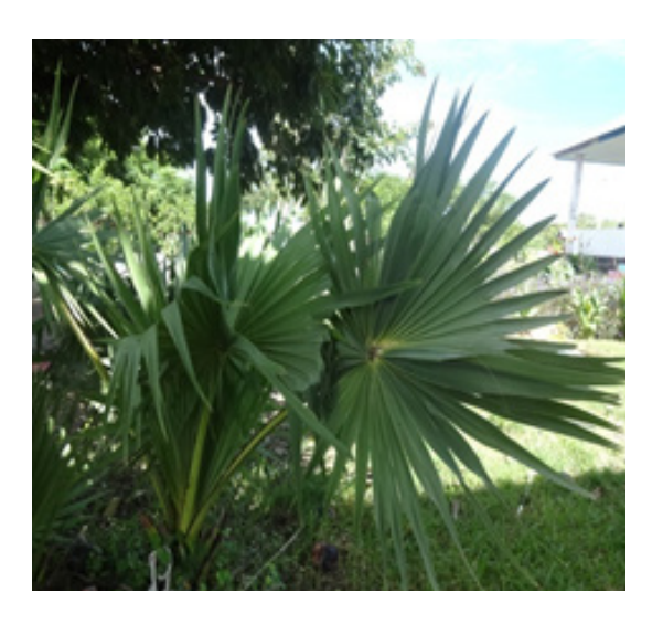
Figure 4. The leaves of a young South Sulawesi lontar palm

The leaves of the lontar palm tree (Figure 4) have a very important role for the overall growth and development of other organs, stem, empelur, flowers and fruit. The lontar palm has odd pinnate leaves appear at the rod tip and whorls that comprise 25 to 40 pieces in the shape of a fan. Each leaf stalk grows up within a month. Green leaf blades, rather gray, have a width of 1 to 1.5 m and form into 60 to 80 segments. Each leaflet bone is supported by leaves 40 to 80 cm in length under strands of leaflets, and have a forked branch. The long petiole is usually woody brown or black, and is thorny along its back.