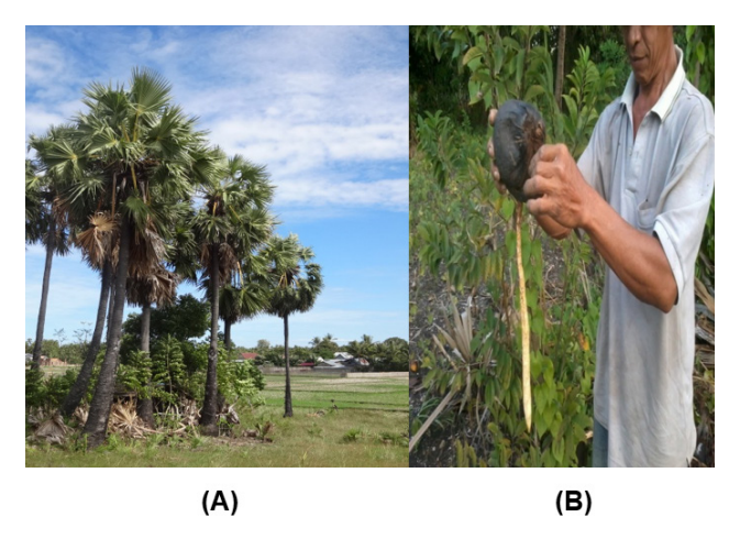
Figure 3. Mature trees (A) and root system of a young South Sulawesi lontar palm (B).