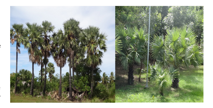
Figure 2. The native lontar palm tree ( Borassus flabellifer Linn) in Jeneponto South Sulawesi, Indonesia

In Indonesia, the palmyra palm is also known as the lontar palm or siwalan tree. The palmyra plant ( Borassus flabellifer Linn; Figure 2 A) belongs to the Arecaceae family. Other names of palmyra plants are listed on Table 1.