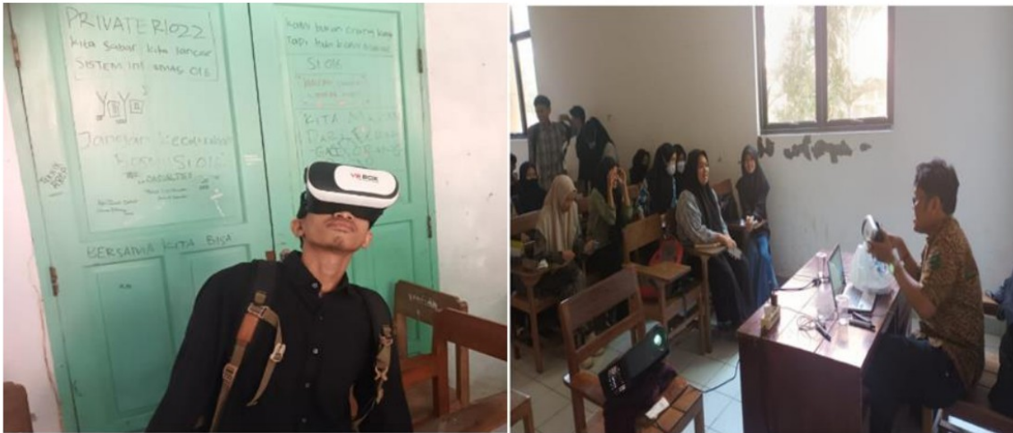
Figure 2. Simulation of the use of metaverse technology