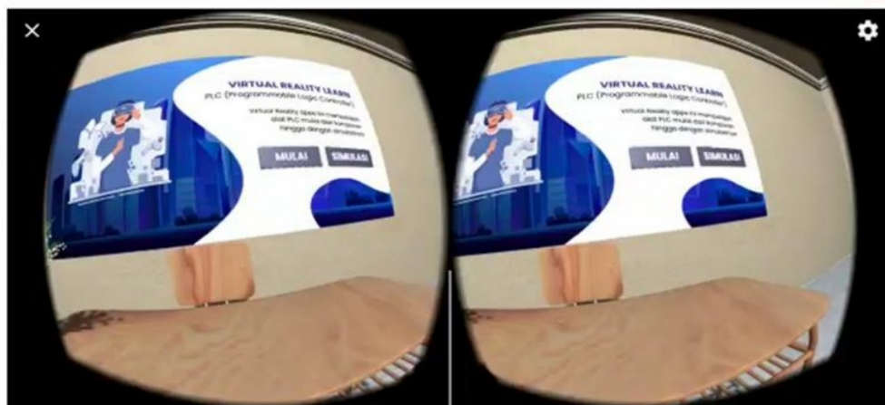
Figure 4. VR Model in metaverse learning media