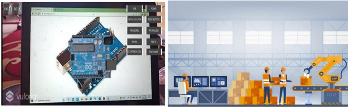
Figure 3. AR Model on Arduino and Application of industrial automation systems