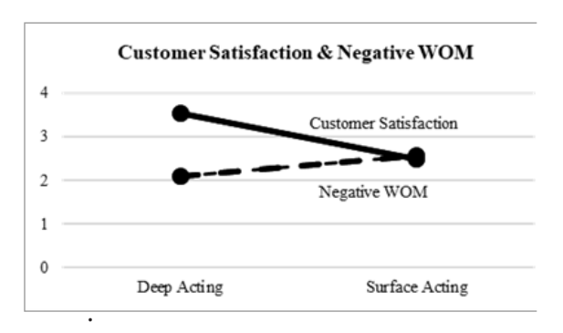
Figure 4. Emotional Labor Strategy on

Figure 4 demonstrate the experimental study which found the significant difference of emotional labor strategy between surface acting group and deep acting group on negative WOM, t (60) = -3.12, p < 0.05 (2-tailed), 95% CI [-0.80 - 0.17]. Test proved that participants in deep acting group performed less negative WOM (Mdeep-acting = 2.10, SD = 0.63), compared with surface acting group (Msurface-acting = 2.59, SD = 0.58). This result supported the hypothesis 2.