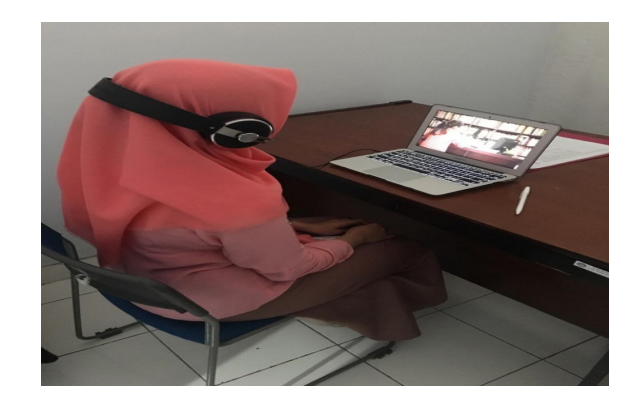
Figure 3. Experiment Process

Figure 3 show that after watching the video, participants were asked to complete the customer satisfaction scale, negative WOM scale, and manipulation check form. The experimenter ensured that all scales have been filled, then closed the experiment and said thanks to all participants.