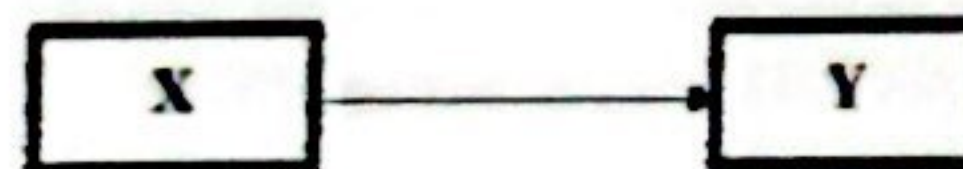
Figure 1. Design of Relationships between Research Variables