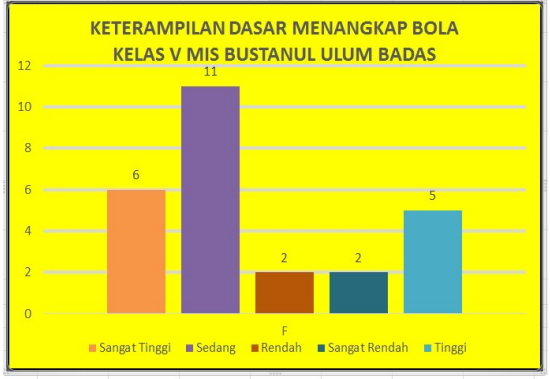
Figure 3. Bar Chart Basic Skills for Catching Ball Rounders Class V MIS Bustanul Ulum Badas

From the results of the data on the basic skills of catching the ball rounders for the fifth grade students of MIS Bustanul Ulum Badas above, it is depicted in the bar chart in Figure 3.