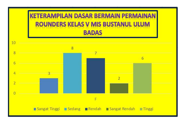
Figure 4. Bar Chart Basic Skills Level Playing Rounders Class V MIS Bustanul Ulum Badas