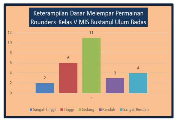
Figure 1. Bar Diagram of Basic Skills Throwing Balls Rounders Class V MIS Bustanul Ulum Badas

If the data from the rounders ball throwing skills of the fifth-grade students at MIS Bustanul Ulum Badas is depicted in a bar chart as shown Figure 1: