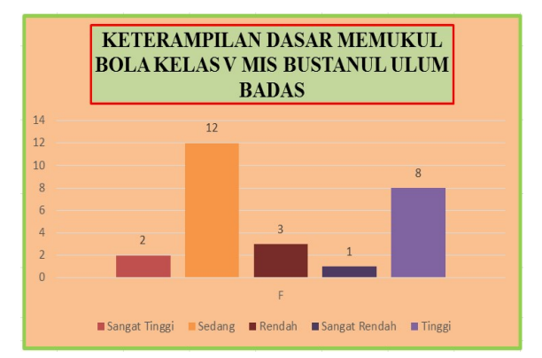
Figure 2 depicts the results of the data on the basic skills of hitting the rounders ball for the fifth-grade students of MIS Bustanul Ulum Badas above in a bar chart:

According to table 2, a total of 26 students were obtained, with as many as 2 students (7.6 percent) having rounders ball hitting skills in the very high category, as many as 8 students (30.7 percent) having rounders ball hitting skills in the high category, as many as 12 students (46.1 percent) having rounders ball hitting skills in the medium category, 3 students (11.5 percent) having rounders ball hitting skills in the low category, and 1 student (3.8 percent) having rounders ball hitting skills in the medium category.