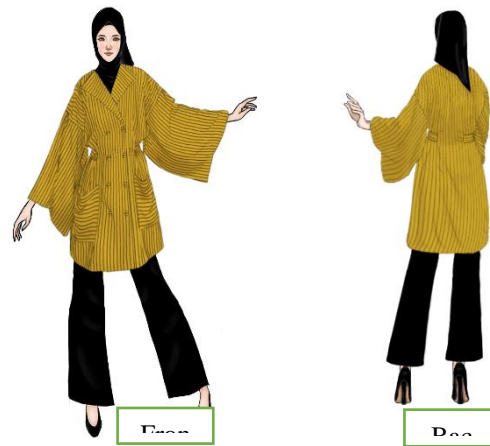
Figure 3: Women's blouse designs

Specifications of clothing products designed for the manufacture of women's clothing is an H silhouette with a center line of the face made using 5 cm overlap, using a rever collar, kimono sleeves. As an accent on this outfit are pockets, belts and buttons. The body size used is size L, namely body circumference: 98 cm, waist circumference: 78 cm and hip circumference: 108 cm. All materials used in this trial are polyester fabrics with a selection of black and yellow striped motifs placed vertically and horizontally.