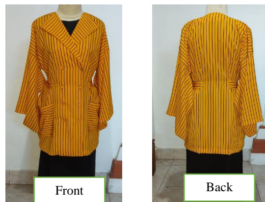
Figure 4: Final Product

The results of women's blouse products after going through the production process are starting from fashion design, placing patterns on fabric without waste, cutting, sewing by machine to finishing clothes so as to produce semi-formal women's clothing. During the production process there are several things that become difficult, namely the placement of patterns, namely it is difficult to arrange the layout of the fabric motifs because it focuses on minimizing waste so that it does not pay attention to the elements of the width and length of the fabric. But even