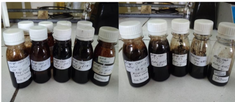
Figure 2. Liquid Smoke for Cocoa Shell (left) and Leaves (right).

From the analysis of TGA and DTG from Cocoa waste Bantaeng District (figure 1), the pyrolysis process had been divided into seven stages. The first stage was a slow reduction of 1.6% of mass observed from 40 to 113.1°C. This event was most likely a result of evaporation of free water enclosed in the resin. Starting at 113.1°C and ending at 556.6°C, a significant drop in mass was observed. This stage could be divided into three sub-stages. The first one occurred between 113°C and 331°C and was connected with a small release of heat observed on the DSC curve – we hypothesize it to be a result of dehydration which is an exothermic reaction and can result in cross-linking of the resin [9]. The second and third stage corresponded to two maxima of the complex exothermic peak observed on a DSC curve at approximately 355.0°C and 480.1°C, indicating an ongoing chemical reaction resulting in a release of heat (such as crystallization, oxidation or combustion) [10].