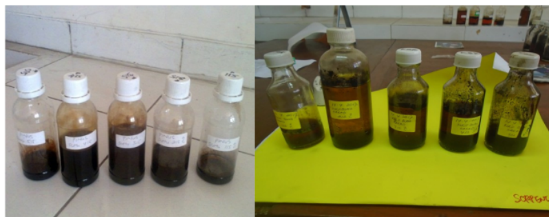
Figure 1. Comparison liquid smoke for wood pine and cacao shell