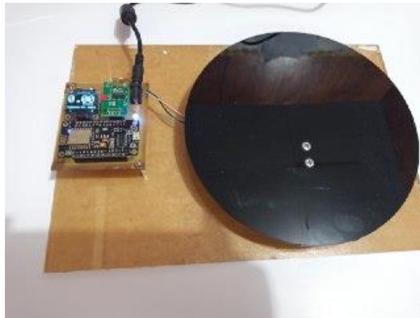
Figure 4. IoT-based Automatic Waste Weigher

The waste weighing equipment is placed into the homes of customers who are part of the BANK SAMPAH organization. This tool is placed in every resident's house. If the plastic waste is already in the position of transportation (for example, the weight limit is 2 kg), the officer will carry the goods.