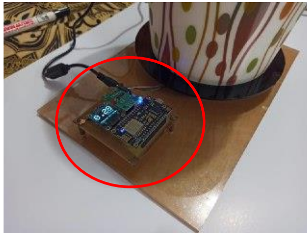
Figure 6. Automatic Waste Weighing Tool using Digital Scales