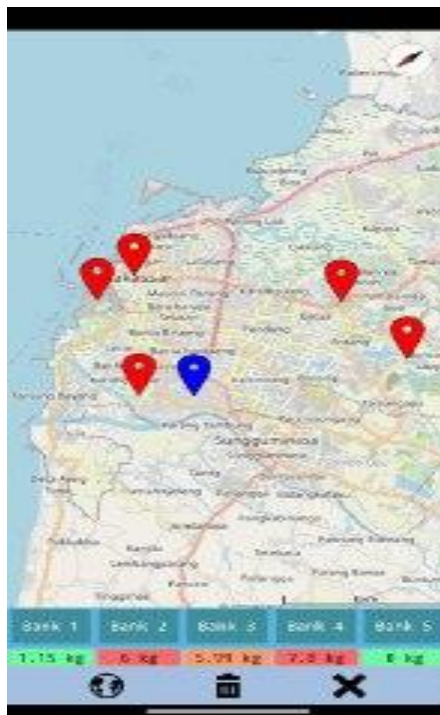
Figure 7. Display of Android Smartphone Garbage Pickup system

When the trash is full, it will be picked up by garbage officers using an application on a Smartphone based on the pick-up location (Figure 7).