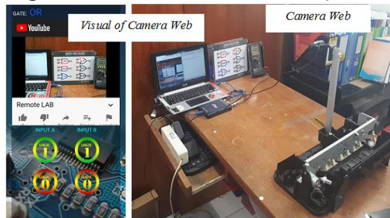
Figure 2. Remote Lab view controlled via Webcamera