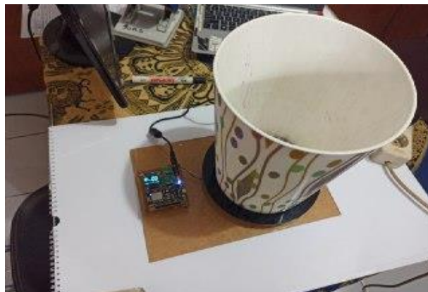
Figure 5. Automatic Garbage Weigher Tool with Garbage Collection Container

The waste weighing equipment is placed into the homes of customers who are part of the BANK SAMPAH organization. This tool is placed in every resident's house. If the plastic waste is already in the position of transportation (for example, the weight limit is 2 kg), the officer will carry the goods.