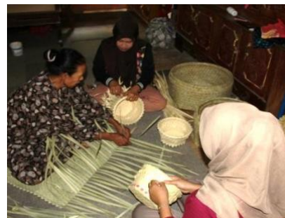
Figure 1. Pictures of weaving and how to make traditional weaving crafts by the community in their spare