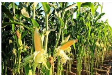
Figure 2. Picture State of the area's natural potential