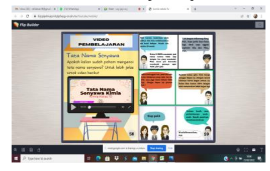
Figure 2. The implementation of E-Comic on SMA Negeri 14 Makassar