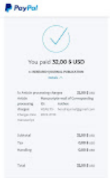
Payment PayPal WJAETS.jpeg 36K