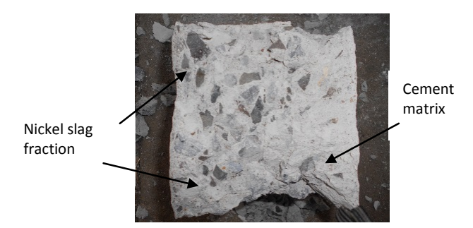
FIGURE 3. Portland Cement Concrete Surface with Nickel Slag Aggregate after the compressive test.

Figure 3 shows the crushed nickel slag aggregate due to the withstand of compressive force in the compressive strength test. The strong bond between nickel slag aggregate and Portland cement matrix is formed by the silica contents in the nickel slag surface [5,6,7]. The bigger and more contact between nickel slag surface and cement matrix, make the bond between Portland cement paste and aggregate will also be stronger.