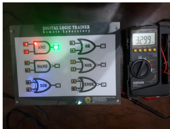
Figure 3. The results of the AND gate output voltage measurement display is in the output state of "1" with a voltage of 3,299Vdc (realtime)

Remote Lab Software consists of Arduino Uno Programming, Firebase, and Android Studio Application.