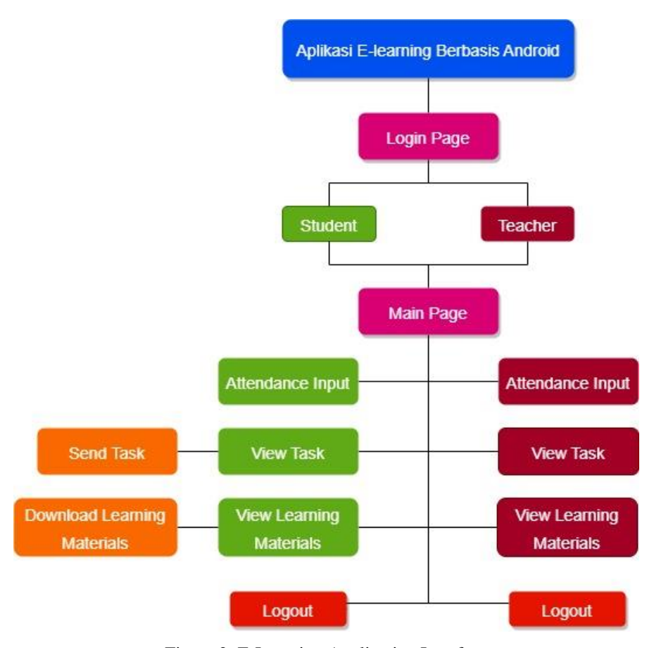
Figure 2. E-Learning Application Interface