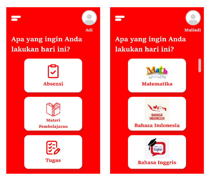
Figure 3. Main Page

The application testing technique in this study uses the blackbox testing method as a method for testing parts of the system that have been built including the login menu, main menu, dashboard menu, student menu and teacher menu (Ginantra et al., 2022). Table 1 is the result of testing the system with the research title "E-Learning Application Design in Android-Based Schools".