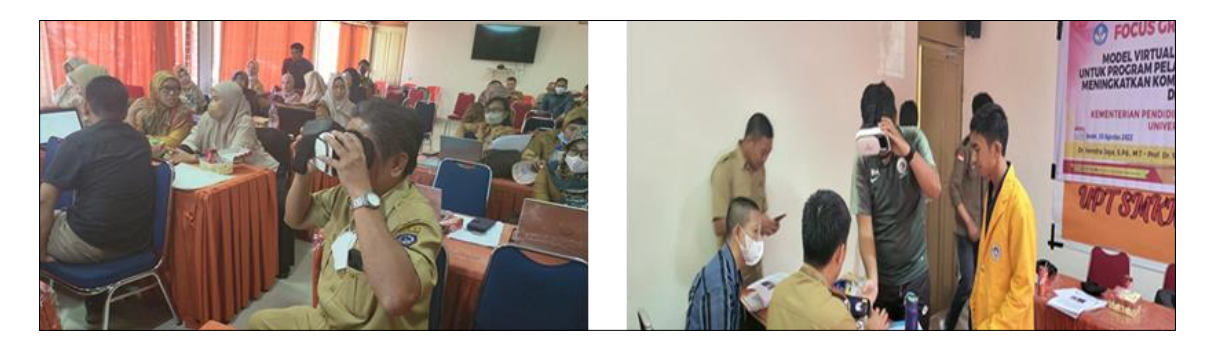
Figure 3 Teachers Implement Virtual Reality

Virtual reality implementation has generally been carried out systematically according to the model or procedure, starting from design, development/production, utilization, management, and evaluation. In particular, the virtual reality implementation model applied by SMK teachers in Makassar City can be described as follows.