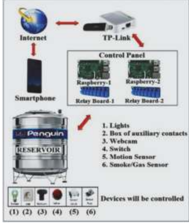
Figure 3 Illustration of reservoir control by using Internet Network