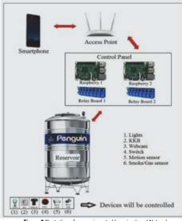
Figure 2 Illustration of reservoir control by using Local Network

After connecting the devices perfectly, the raspberry is download and tested for all electrical devices, as shown in Tab. 1 to Tab. 4.