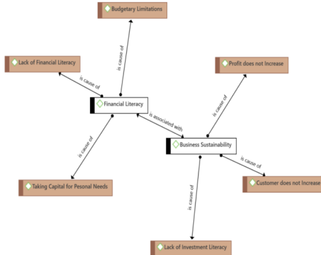
Figure 2. Micro Business Network