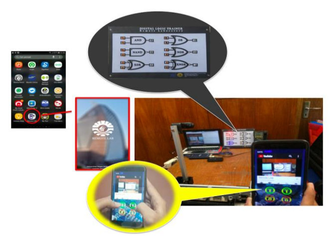
Fig. 3. Remote Lab as a Tool to Overcome the limitations of Practicum facilities without present in Real Lab (Designation of Value in Real-time with Real devices)

The Remote Lab model of Digital Electronics is one form of interactive multimedia that can support conventional practice in real laboratories. After seeing the conditions and needs regarding the need for a learning strategy that is Distance Learning through Remote Lab, the next step is to search for models and designs that will be developed. Determination of the model is intended to choose the right model and look for references to the model to be developed. While the design determination concerns the software that will be used in developing Remote Lab-based learning in this case using Smartphone Android, the Arduino UNO Microcontroller, IoT, Android Applications, and Interface Arrangements. In doing the practicum by using the Remote lab. The device needs to be installed first. Furthermore, this virtual remote can be used online. to do a practicum measuring electric current and voltage, students still use the module as a guide in carrying out the practicum. Furthermore, measuring current and voltage, and waveforms with real devices are multimeters and oscilloscopes (picoscope), and it is possible to use other real equipment (Fig.3).