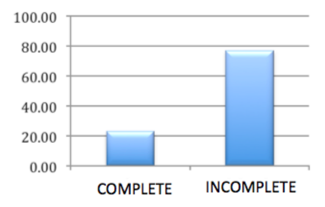
Fig. 1. Graph of completeness of practical equipment in SMK

Preliminary research conducted by researchers to obtain an overview of the needs of vocational high school students (SMK) relating to the implementation of practicum in schools. The first step taken by the researcher is to analyze the students' needs of the practical facilities and infrastructure at school. To analyze the availability of facilities and infrastructure and the needs of students, a needs analysis instrument is used which contains several indicators including the completeness of facilities and infrastructure in schools, the adequacy of practicum time in a real laboratory. In addition to distributing questionnaires there were also observations, direct observations and interviews with subject teachers related to digital electronics practicum. This activity was carried out by involving 2 Vocational High Schools in Makassar, one State Vocational School and one private Vocational School involving 64 respondents. The distribution of questionnaires to the two schools was carried out at different times with 30 respondents of SMKN 2 students and 30 respondents from SMK Muh 2 Bontoala. For SMKN 2 involving 2 teachers, and in SMK Muhammadiyah 2 Bontoala involving 2 teachers. The results of the analysis of the 60 respondents are shown in Figure 1.