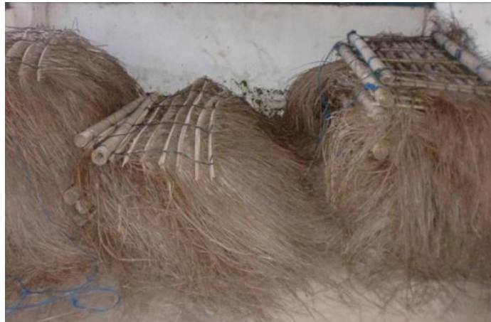
Figure 3. Balla-balla

Similar to other local communities, the patorani also have a distinct knowledge system based on their beliefs, hunches, smells, hearings, and sights applied in their actions on land and at sea. This practice enables the robust survivability of a custom, culture, and tradition in a community until now, making modernization and external influence incapable of transforming people's understanding that has been patterned in the form of knowledge and habit (Chakravartty & Sharma, 2013). The local people's traditional knowledge can be observed in their ability to local discernment local wisdom in the form the natural circumstances for sailing and catching torani fish.