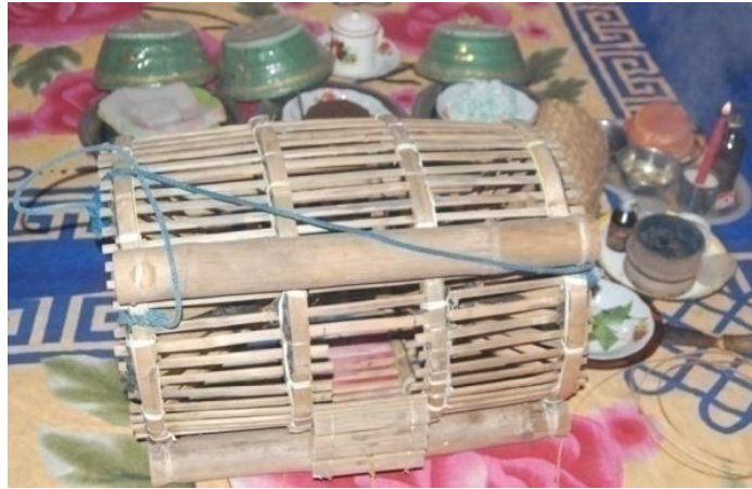
Figure 2. Pakkaja

humans and nature (Thompson, Lantz, & Ban, 2020). The pakkaja and balla-balla fishing gears are illustrated in Figures 2 and 3.