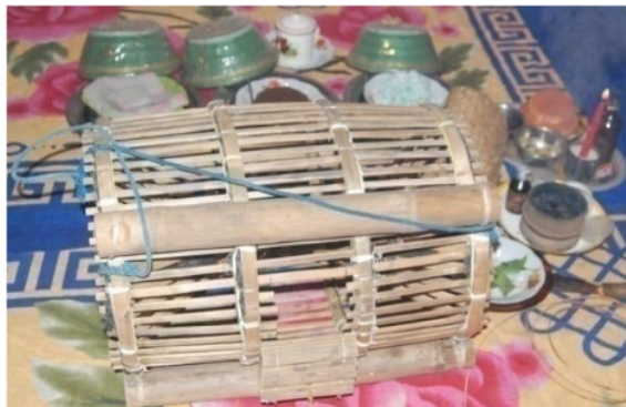
Figure 2. Pakkaja

humans and nature (Thompson, Lantz, & Ban, 2020). The pakkaja and balla-balla fishing gears are illustrated in Figures 2 and 3.