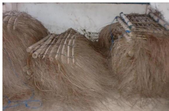
Figure 3. Balla-balla

Similar to other local communities, the patorani also have a distinct knowledge system based on their beliefs, hunches, smells, hearings, and sights applied in their actions on land and at sea. This practice enables the robust survivability of a custom, culture, and tradition in a community until now, making modernization and external influence incapable of transforming people's understanding that has been patterned in the form of knowledge and habit (Chakravartty & Sharma, 2013). The local people's traditional knowledge can be observed in their ability to local discernment local wisdom in the form the natural circumstances for sailing and catching torani fish.