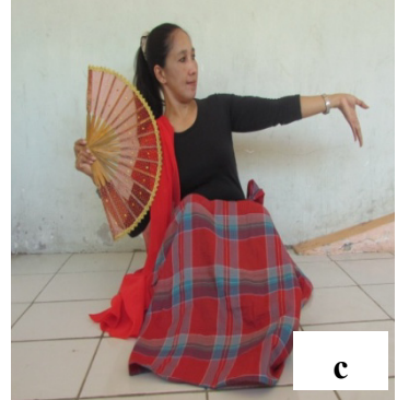
Figure 2(a). Ragam Mallappek Sipik, (b) Ragam Mioro Mijaramming, (c) Ragam Mioro Mikundur

Validation results show that the five instructional videos assessment criteria have been met, namely ease of understanding the menu, easy to use menu, the attractiveness of the display menu, the attractiveness of the public view, the attractiveness of the display wide-range of motion, and clarity of the displayed range of motion.