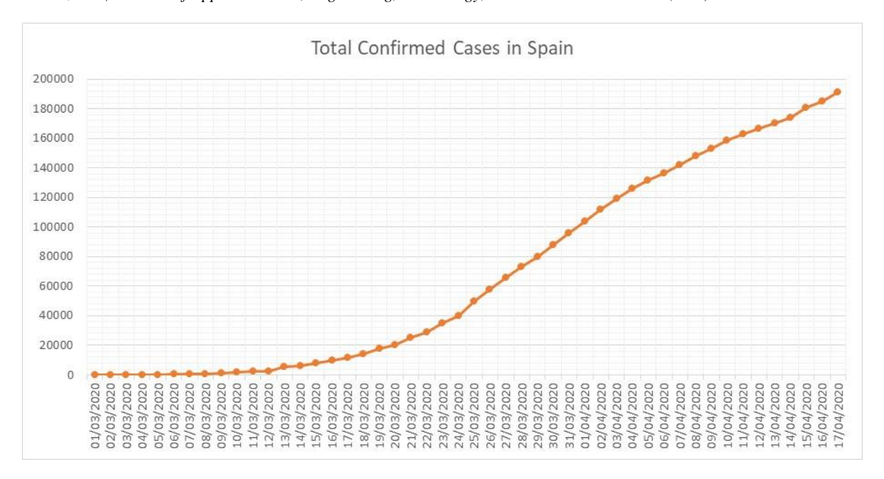
Fig. 1 Confirmed Cases of COVID-19 in Spain (01 March 2020 – 17 April 2020)