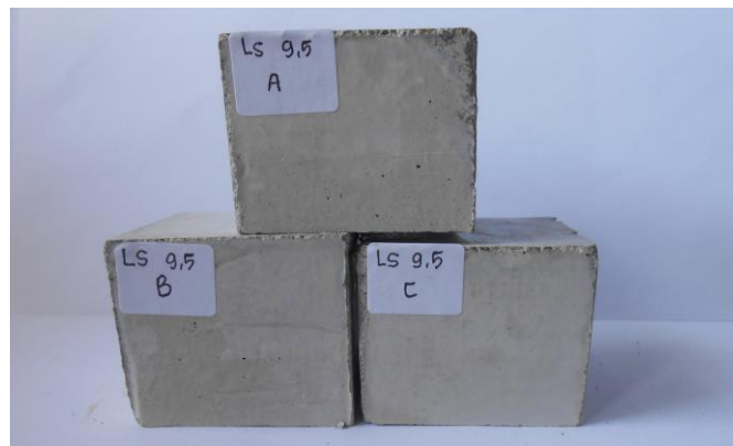
Figure 1. Concrete with nickel slag (aggregate size:9.50 mm) as aggregate.

The raw materials including Portland's cement, sand, water and nickel slag (grain size: 9.50 mm) were mixed together according to SNI 04-1972-1990 composition for making high-quality K-350 concrete (compressive strength value: 31.20 MPa). The paste then molds into three cubes with dimension (5 \times 5 \times 5) cm 3 is shown in Figure 1 and let them dried. All of the concrete then cured by dipping into the water for seven days according to SNI 03-2847-2002. The same procedure was repeated by varying the aggregate size of nickel slag at 5.60 mm, 2.36 mm and 2.00 mm also the combination of those fourth aggregate size (9.50 mm, 5.60 mm, 2.36 mm and 2.00 mm). The compressive strength test of concrete was carried out according to ASTM C39M-01 using universal testing machine controller ( Testometric ) and then characterized using SEM-EDS ( Tescan Vega3 ) to investigate surface morphology and the interface zone.