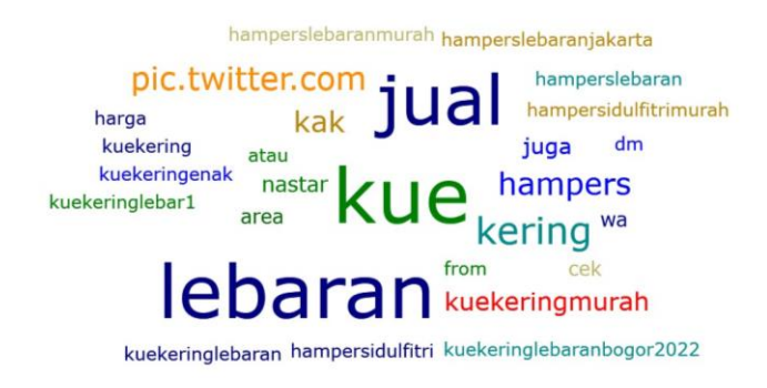
Figure 3: Word Clouds about Kue lebaran ATLAS.ti output that has been processed by researchers

Furthermore, based on the word cloud analysis, several popular words in the tweet were obtained, as presented in Figure 3: