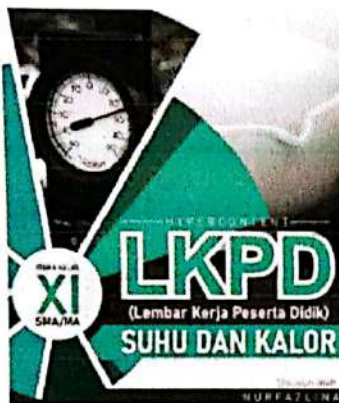
Figure 2. Cover of student worksheet

The next step is to make a simple student worksheet cover with an attractive color combination and image.