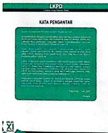
Figure 3. The view of preface page

Writing the introduction is very important because it is located on the very first page so that it will be the first part that the reader sees. The introduction is also equipped with an encouraging description to arouse the interest of students in particular to work on the student worksheets.