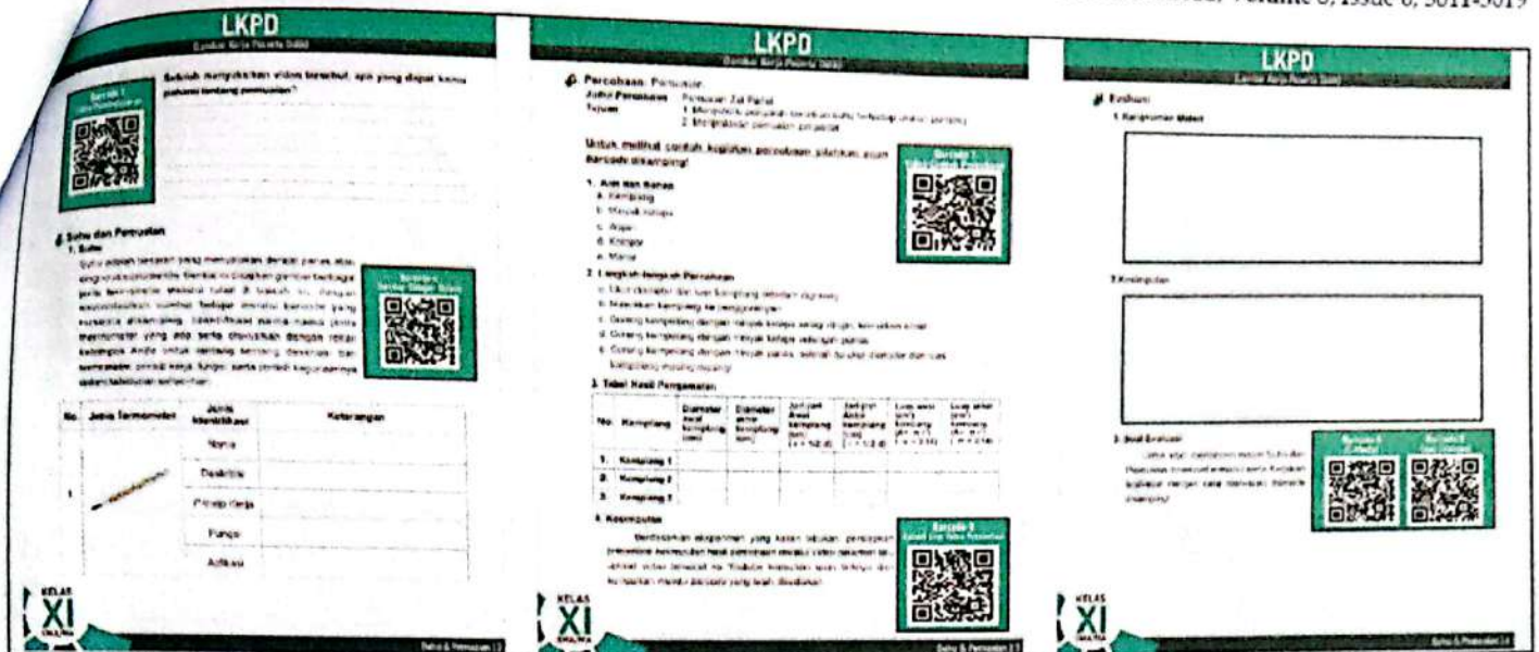
Figure 5. Content of Students Worksheet

The student worksheets that had been developed were validated by two valutors before being implemented in the real class. The following were the results of expert validation on student worksheets as shown in table 6.