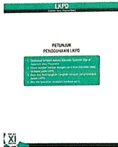
Figure 4. The page view of Student worksheet usage instructions

Instructions for using the student worksheet are very important because the Student Worksheet developed in the form of a hyper content-based student worksheet with the help of a QR code, it is necessary to write down how to use and access it so that there is no confusion in the use of the Student Worksheet.