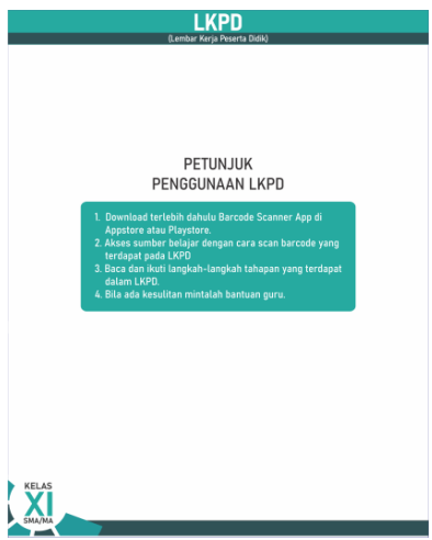
Figure 4. The page view of Student worksheet usage instructions

Instructions for using the student worksheet are very important because the Student Worksheet developed in the form of a hyper content-based student worksheet with the help of a QR code, it is necessary to write down how to use and access it so that there is no confusion in the use of the Student Worksheet.