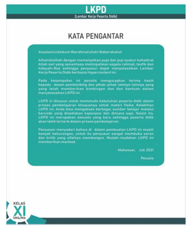
Figure 3. The view of preface page

Writing the introduction is very important because it is located on the very first page so that it will be the first part that the reader sees. The introduction is also equipped with an encouraging description to arouse the interest of students in particular to work on the student worksheets.