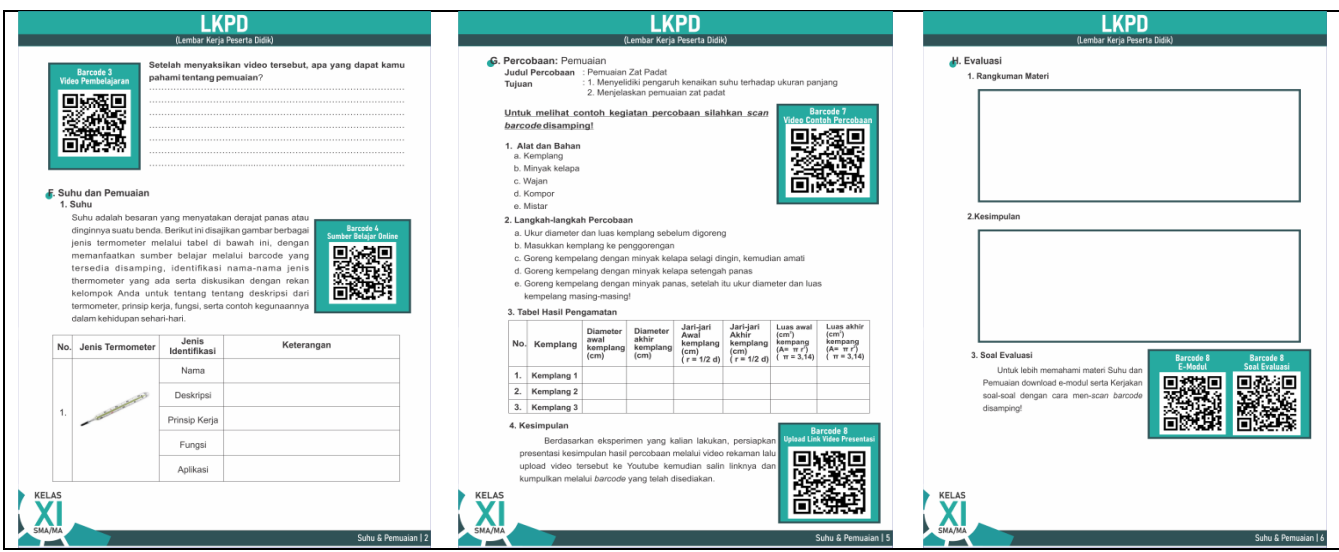
Figure 5. Content of Students Worksheet

The student worksheets that had been developed were validated by two valuators before being implemented in the real class. The following were the results of expert validation on student worksheets as shown in table 6.