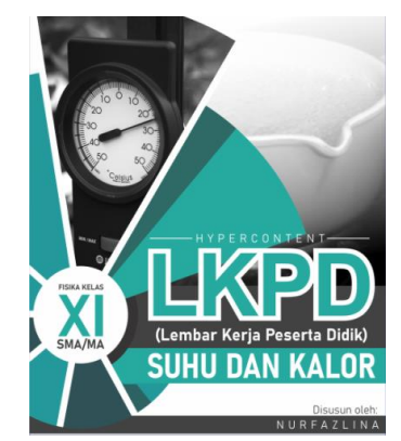
Figure 2. Cover of student worksheet

The next step is to make a simple student worksheet cover with an attractive color combination and image.