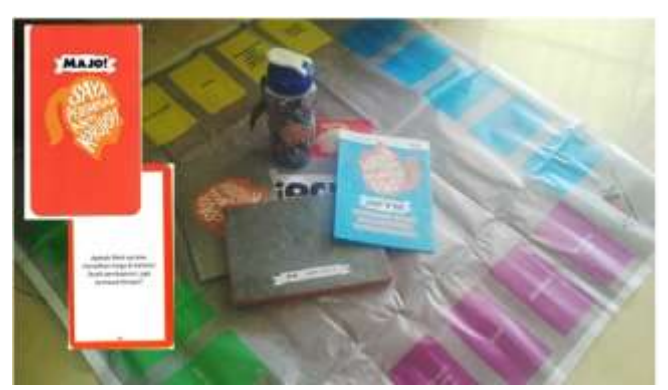
Figure 1: Learning-based Media Card Anti-Corruption

The development of attitudes, moral, and personal learners need long process and continuing with the habit [5]. Therefore, the need for anti-corruption education model keeping in the early childhood becomes demanding in instilling attitudes, moral and confident personality. For children of junior high school age, anti-corruption education is very active if conducted through fun educational games. One of learning models that appeals to children is by using picture cards (Figure 1).