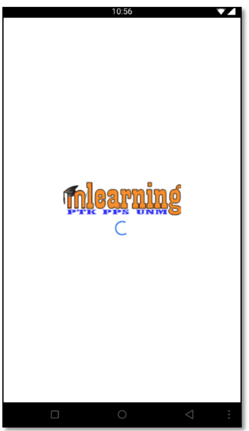
Figure 1: Display of Home Applications