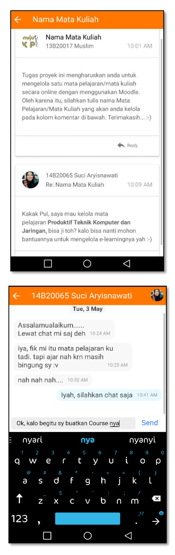
Figure 3: Display of Forum facilities and Messages