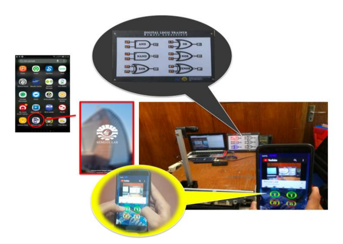
Fig. 3. Remote Lab as a Tool to Overcome the limitations of Practicum facilities without present in Real Lab (Designation of Value in Real-time with Real devices)

The Remote Lab model of Digital Electronics is one form of interactive multimedia that can support conventional practice in real laboratories. After seeing the conditions and needs regarding the need for a learning strategy that is Distance Learning through Remote Lab, the next step is to search for models and designs that will be developed. Determination of the model is intended to choose the right model and look for references to the model to be developed. While the design determination concerns the software that will be used in developing Remote Lab-based learning in this case using Smartphone Android, the Arduino UNO Microcontroller, IoT, Android Applications, and Interface Arrangements. In doing the practicum by using the Remote lab. The device needs to be installed first. Furthermore, this virtual remote can be used online. to do a practicum measuring electric current and voltage, students still use the module as a guide in carrying out the practicum. Furthermore, measuring current and voltage, and waveforms with real devices are multimeters and oscilloscopes (picoscope), and it is possible to use other real equipment (Fig.3).