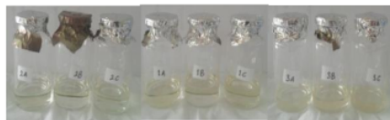
Figure 3. The aromatic fraction samples Tanjung Bayang beach sediment

The dried extract was fractionated to separate the aromatic and aliphatic compounds using flash Chromatography Column Flash (CCF) with silica gel, alumina powder and sodium sulfate at the stationary phase. The aliphatic and aromatic fractions were separated based on the polarity. The non-polar aliphatic fraction is attached to the solvent n-hexane while the semi-polar aromatic fraction is attached to the DCM solvent. The PAHs fraction is pale yellow. According to [10], the color PAHs ranging from colorless, to white or pale yellow. The aromatic fraction resulting from CCF extraction is shown in Figure 3.