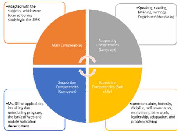
Fig. 1. Main skill and supporting expertise proposed in certification of Vocational Graduate Skills

Once the above values trained and instilled in a school environment with the assistance of experienced trainers, they will be able to shape students' social and spiritual attitudes. At the end of the character building, learners will be given the opportunity to take an attitude competency test by establishing a team-coordinated humanitarian activity that begins by identifying social needs. Each group that will be formed consists of 6-7 people and will be obliged to make a social activities proposal to train and practice their affection values. The final outcome of the humanitarian project activities will be presented and assessed in front of trainers and teachers. The final result is that learners will get an affection competency assessment that refers to an attitude assessment as in the curriculum 2013. The result of affective competence assessment will be reported in a certificate signed by the school leader together with the trainer with self-development training certification. The learner competence is an indicator that he/she has fulfilled the required competencies to be ready to enter the workforce.