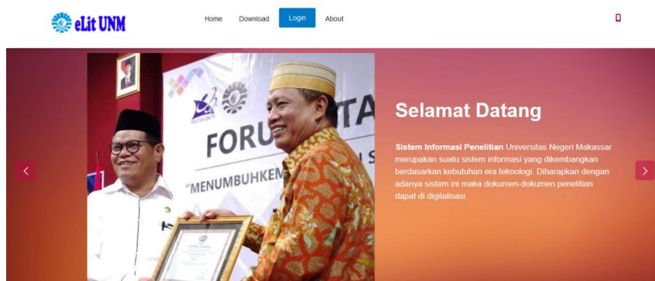
Figure 1 The Login Display of Research Information System

In this login section, the lecturer uses the username and password in the Academic Information System (SIA) of Universitas Negeri Makassar. If there are users who do not have username and login password in SIA, then username and password can be created by research institute operator (figure. 1).