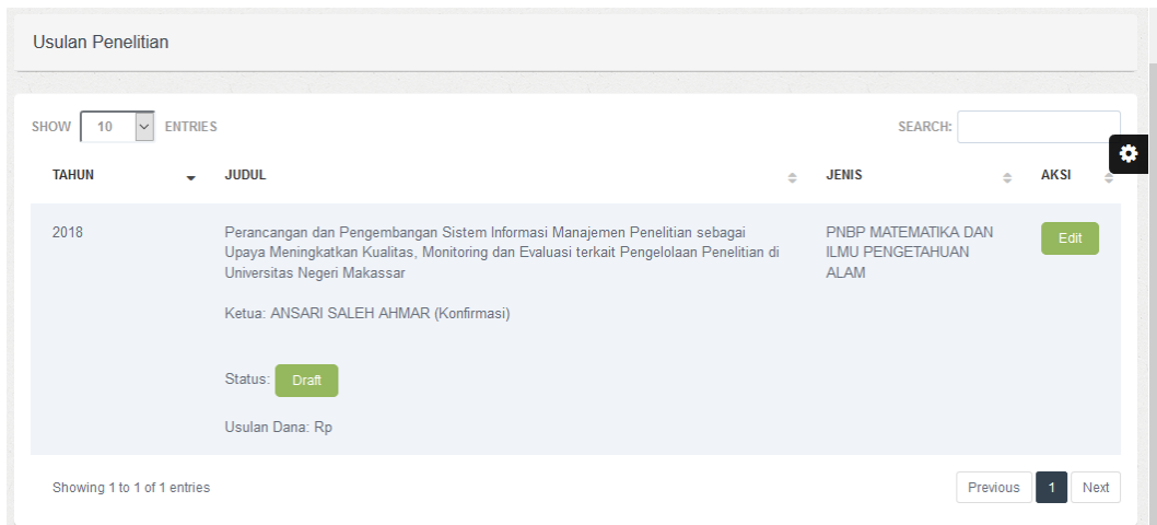
Figure 4 The Display of the Research Proposal

After the researcher conducts the initial submission of the research, the next step is to fill in the data: (a) the identity and common description, (b) the data of the research personnel, (c) the research costs, (d) print the validation sheet, and (e) upload the proposal in order to be scored. The view of this development can be seen in figure 5-8.