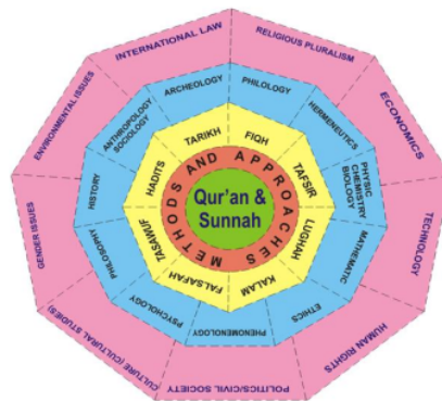
Fig 1. The integration-interconnection of scientific paradigm

The integrated-interconnected approach is developed in Islamic and general sciences. Consequently, this approach is applied in the humanitarian, social, and natural sciences in the aspect of general sciences. These scientific fields are further developed through schools, madrasahs and universities. The integration-interconnection scientific paradigm is described in fig 1.