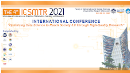
Background zoom_ICSMTR_Fix.png 796K