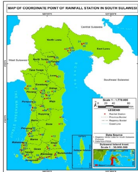
Figure 1. Coordinate Points for Rainfall Stations in South Sulawesi Province.

According to the equation (3), it is used to estimate the distribution parameters