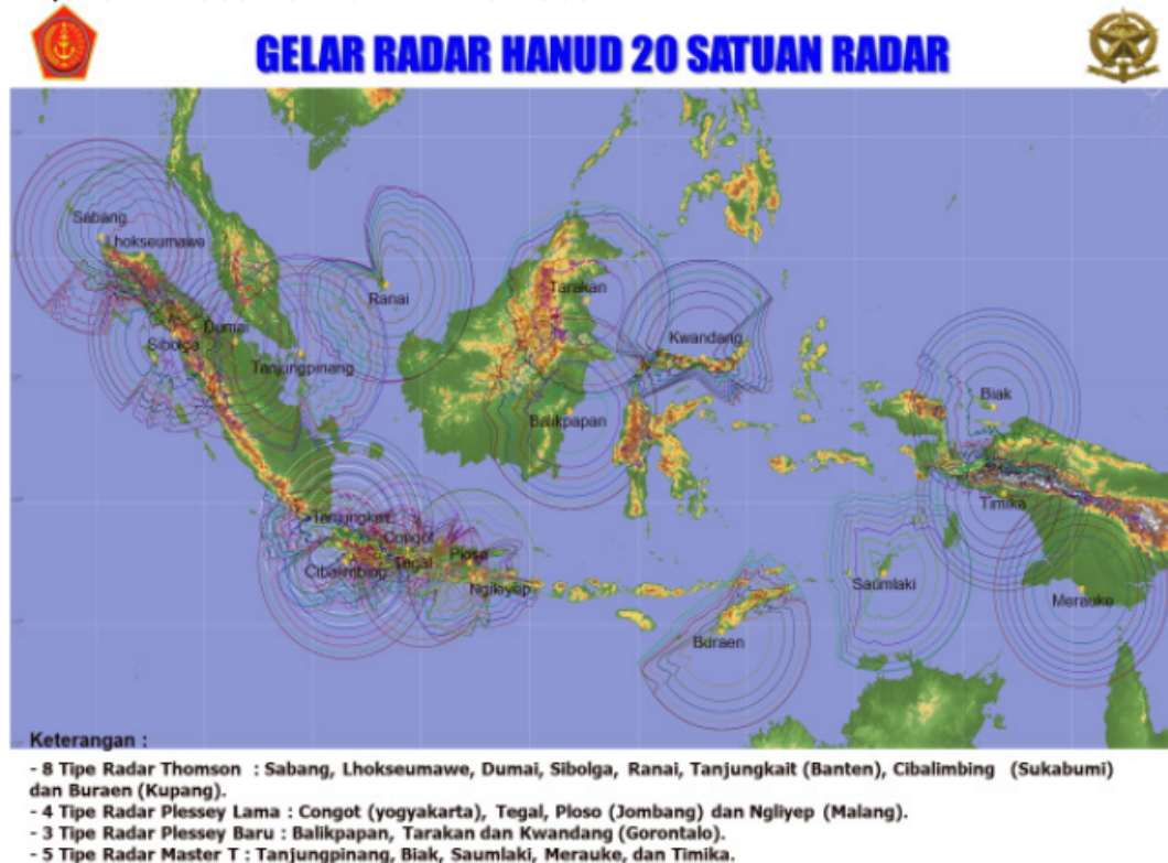
Figure 1. Placement of TNI-AU Radar

In contrast to alutsista such as Radar, its deployment is almost in all parts of NKRI, although the number is still relatively minimal when compared with the area of NKRI. Radar has been deployed in twenty areas, namely: (1) Satrad 211 Tkt at Tanjung Kait; (2) Satrad 212 Rni in Ranai; (3) Satrad 213 Tpi in Tanjung Pinang; (4) Satrad 214 Pml in Pemalang; (5) Satrad 215 Cgt in Congot; (6) Satrad 216 Cbl in Cibalimbing; is in the area of Air Defense Sector Command 1 (Kohanudnas I) in Jakarta; (7) Satrad 221 Nli in Ngliyep; (8) Satrad 222 Plo di Ploso; (9) Satrad 223 Bpp Behind the Board; (10) Satrad 224 Kwd in Kwandang; (11) Satrad 225 Trk in Tarakan; Satrad 226 Brn in Buraen; (12) Satrad 231 Lse in Lhokseumawe; located in the area of Kosekhanudnas II in Makassar; (13) Satrad 232 Dmi in Dumai; (14) Satrad 233 Sat in Sabang; (15) Satrad 234 As in Sibolga; (16) Satrad 241 Brn in Buraen; located in the territory of Kosekhanudnas III in Medan; (17) Satrad 242 in Biak; (18) Satrad 243 in Timika; (19) Satrad 244 in Merauke Papua; (20) Satrad 245 Saumlaki in Maluku, located in the area of Kosekhanud IV in Biak. TNI AU military radar coverage in the NKRI can be seen in the picture below.