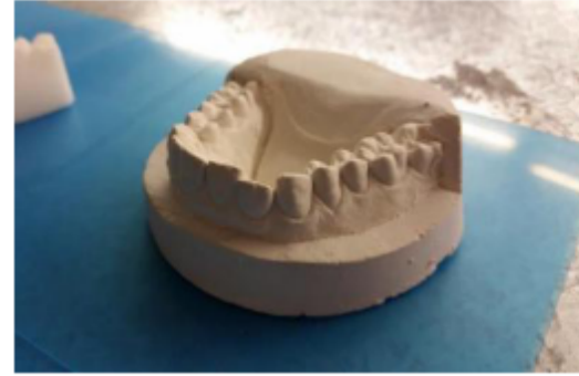
Fig. 6. The pattern is made to be used as a mold base in the vacuum forming process. This mold is made using a 3D printer machine

dimensions then created the patterns are essentially to be realized in 3D using a clay model of a formation which will result in molding as its pattern. The process of making this pattern requires carefulness in the achievement of details by digital planning.