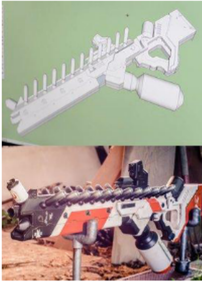
Fig. 3. 3D modeler

The same costume pieces can be created by modeling the parts around a stock human form. They will usually do this when planning large, bulky armor sets so that we can check out the scale and silhouette of the costume and plan our build accordingly. Even if these 3D files are not used for 3D printing or Pepakura, it is still incredibly useful as a visual aid for the costume fabrication.