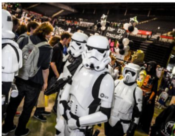
Fig. 1. The cosplayers use Stormtrooper Armor costumes

Moreover, a sheet of hot, flexible plastic is drawn either into or all over the place in a mold with suction provided by a vacuum pump in the vacuum-forming process. It preserves the shape produced by the mold when the plastic cools and hardens [4]. Based on the results of the development of creative plastics product prototypes with vacuum forming method. There are obstacles related to suction power or vacuum power that have an impact on the shape detail with small mold details and sharp angles. Therefore the focus of prototype development focused on efforts to improve the problems obtained.