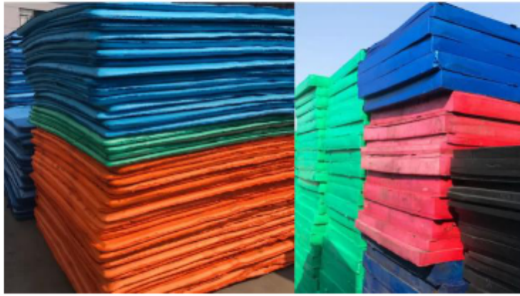
Fig. 9. EVA material is the most favorite material used by cosplay costume designers in the creative cosplay industry

7) Acrylonitrile Butadiene Styrene (ABS) : Few thermoplastic polymers have as much commercial success as acrylonitrile butadiene styrene (ABS). It has been used for an assortment of applications, largely because of its performance, cost, and compositional flexibility. ABS divides the line between engineering polymers and commodity polymer in both price and performance. Thus, when an application calls for semi-structural rigidity, ABS is a prime candidate over commodity plastics for performance and over-engineering plastics for the cost. Also, there is flexibility in the composition and synthesis that allows tailoring of ABS to specific applications [19]. ABS is currently the most widely used material in many industry manufacturers. Cosplay costumes are included in the creative industry due to the many advantages of these materials.