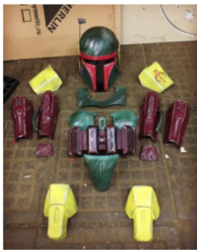
Fig. 5. The prototype of Mandalorian armor

Figure 5 above shows the female version processing by vacuum forming methods with PVC material. Based on the process described above from the digital visualization process to the prototype form illustrates that the digitization process is a phase in which various decisions to finalize the form are executed even though it is still possible to be retained until the final form is obtained.