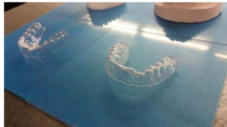
Fig. 7. Molding results using vacuum forming with PET plastic material