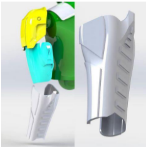
Fig. 4. The 3-Dimensional digital visual presentation of products that will be created using a vacuum forming

The same costume pieces can be created by modeling the parts around a stock human form. They will usually do this when planning large, bulky armor sets so that we can check out the scale and silhouette of the costume and plan our build accordingly. Even if these 3D files are not used for 3D printing or Pepakura, it is still incredibly useful as a visual aid for the costume fabrication.