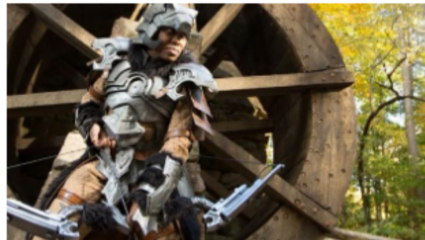
Fig. 2. Camara, Lee. Fit in cosplay

important stage of all stages in the creative process. The sketch stage becomes the most important point as a foundation in producing various works. Because at this stage all ideas and ideas are configured in detail and are used as references in the next stages of the process.