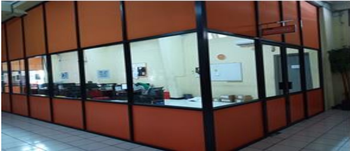
Fig. 1. Open Employee Workspace

The open arrangement of the space gives the advantage of the open layout of the room that looks big because there is no visible hallway blocking the circulation path from employee mobility. In addition, open layout can minimize the cost of using material for insulation. Another advantage of open layout is that it makes it easier to rearrange your furniture needs if you have to dismantle it and adjust it to work needs. This layout form is suitable for jobs where employees do not require high concentration because the noise between cubicals has the potential to disturb, compared to the sound that works is blocked by walls.