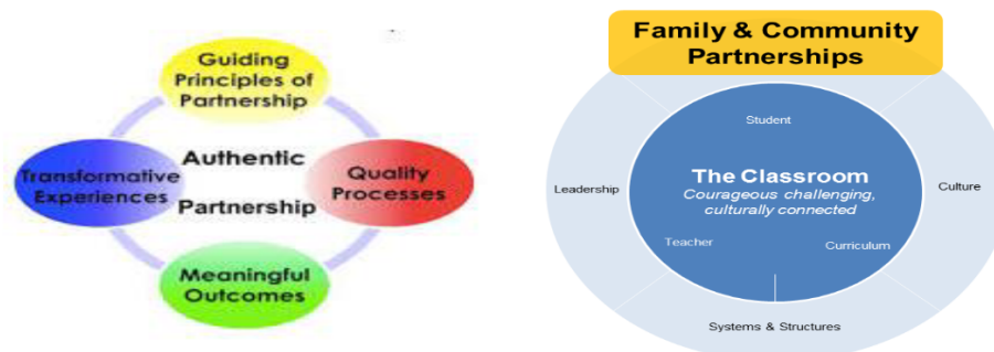
Fig. 2. Authentic Partnership

In order to create the conditions that enable effective family-school partnerships to be developed and sustained, the following supporting structures need to be in place at both systemic and school levels: