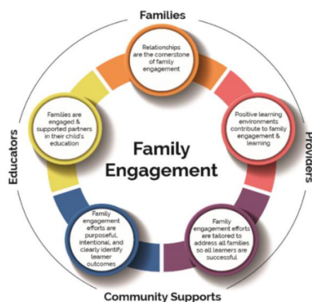
Fig. 1. Family Engagement

3 Schools have an important responsibility in helping to nurture and teach future generations and families trust schools to provide educational foundations for their children's future. At the same time, schools need to recognise the primary role of the family in education. This is why it is important for families and schools to work together in partnership. Research demonstrates that effective schools have high levels of parental and community involvement. This involvement is strongly related to improved student learning, attendance and behaviour. Family involvement can have a major impact on student learning, regardless of the social or cultural background of the family.