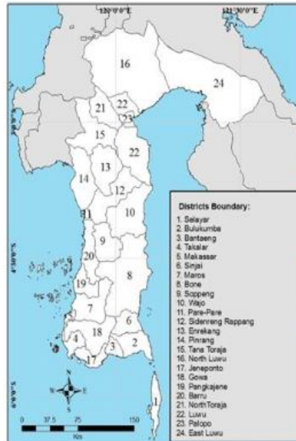
Figure 1. Administrative Map of South Sulawesi

South Sulawesi Province is located between 0°12'- 8° South Latitude and 116°48'-122°36' East Longitude. The province is bordered by Central Sulawesi and West Sulawesi in the North, the Gulf of Bone and Southeast Sulawesi in the East, Makassar Strait in the West and Flores Sea in the South. Its area is 45764.53 km 2 which includes 24 districts [9]. The map of South Sulawesi can be seen in Figure 1.