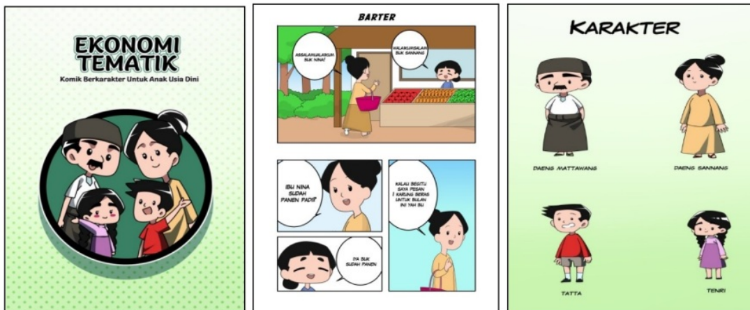
Figure 1. he design of the comic

The average score of assessment performed by design experts was 90.5 indicating that the design of the comic was feasible for the trial step. The experts suggest improving the color of the cover and the consistency of terms used in the comic. It can be seen in figure 1