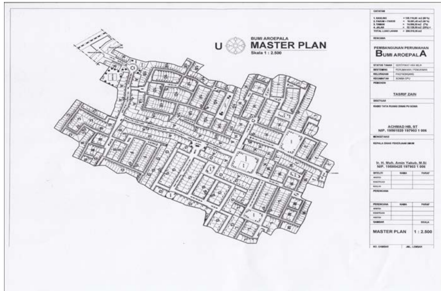
Fig. 5: Site plan Housing Earth Aroepala; PT: New shoots Sulawesi (2014)