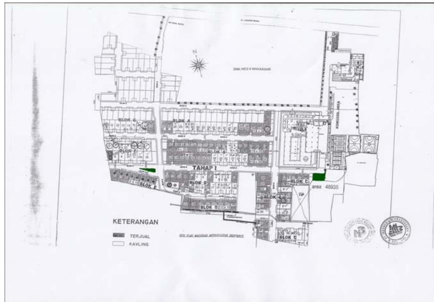
Fig. 3: Site plan Makassar Metropolitan Housing Residence; PT: Nusasembada Bangunindo (2014)