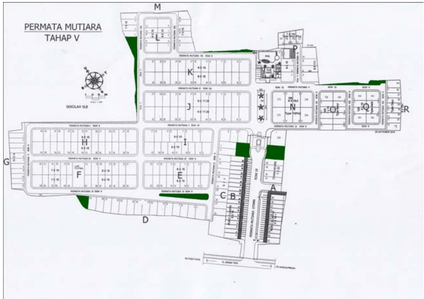
Fig. 1: Site plan Mutiara Permata Housing; PT: Sari Citra Cemerlang (2014)