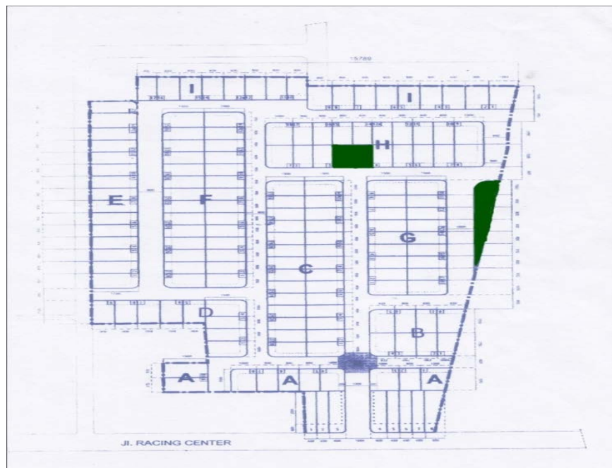
Fig. 4: Site plan Housing Bumi Tirta Nusantara Gardenia; PT: Mega Buana Nusantara (2014)